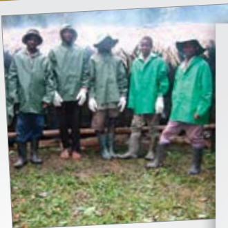
A dangerous job