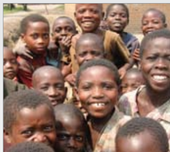
Community work still the key